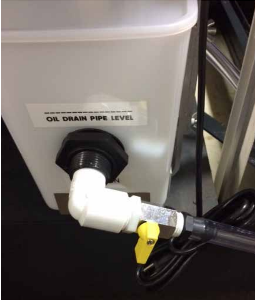
Attached Oil Drain Hose, Valve Closed